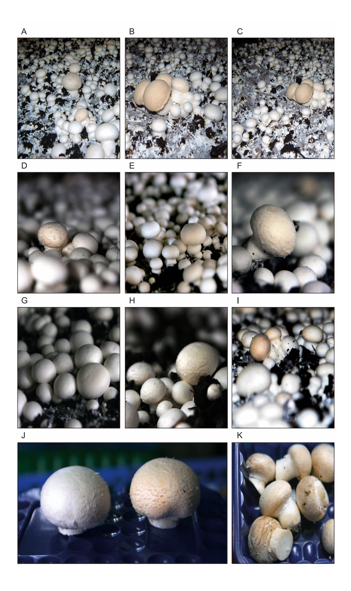
Fig. 1. Various browning symptoms on mushrooms with MVX \,